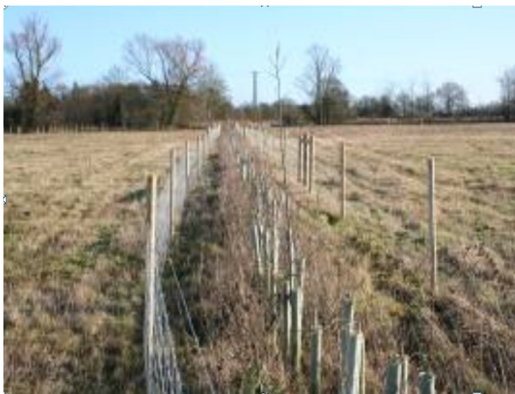
Fig 3. A new hedge around a newly planted grazed orchard with damsons, bullace and cherry plums amongst native hedge species. The saplings are protected by quills (50cm narrow tubes) or spirals. Planting hedge crop species one year earlier than the other species helps them establish faster. Stock fencing should be a minimum of 1.5m from the hedge centre on each side to minimise browsing and allow larger hedges.

Tube guards eventually burst (initially at the base) as the trunk expands, and bare stems will then be vulnerable to grazing at the base by rabbits. (If taken off before any splitting seriously distorts the plastic, most tube tree protectors can be re-used. They will need to be completely spilt to remove them from the original tree and then re-assembled around a new planting with cable ties to hold the tube in shape).