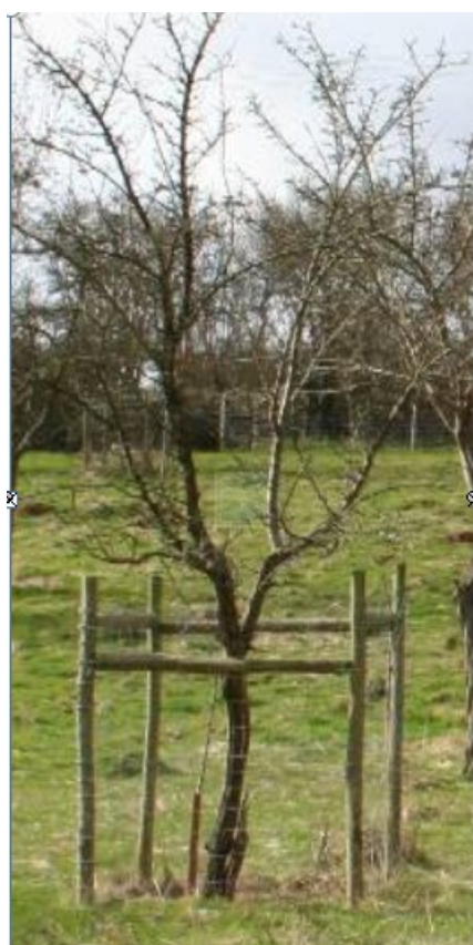
Fig . 8 For protection against cattle grazing: a 2m high post-&-rail system.

Rabbits will graze inside the stock fence and therefore some protection is always essential inside the stock fence.