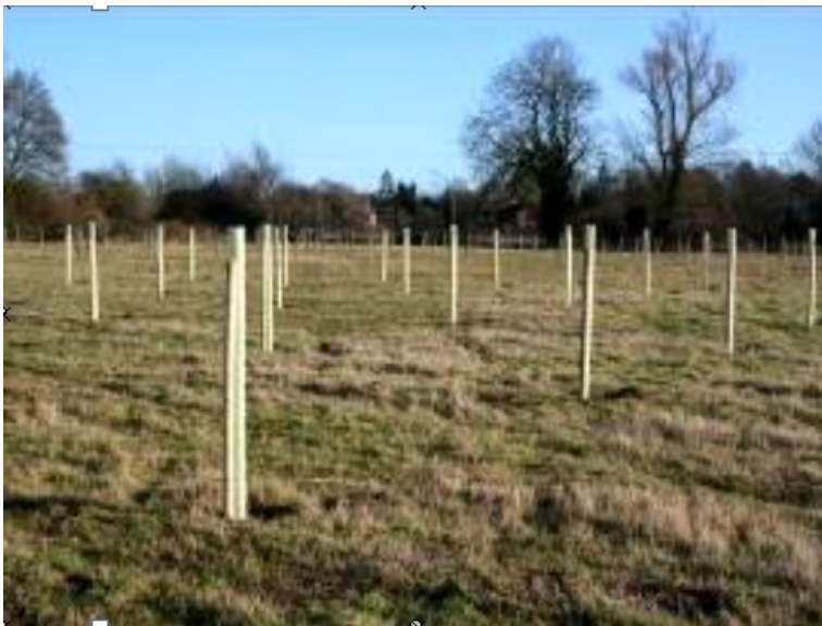
Fig 2. A new orchard planting

1.2 m Tubex and 65 mm x 1.68m (6 ft) posts, 7m apart, in lines 8m apart. This is a quincunx* arrangement (see explanation in box) and is intended for grazing by small sheep breeds. Trees reach out of the tubes and are intended to be half-standards branching at about 1.5m.