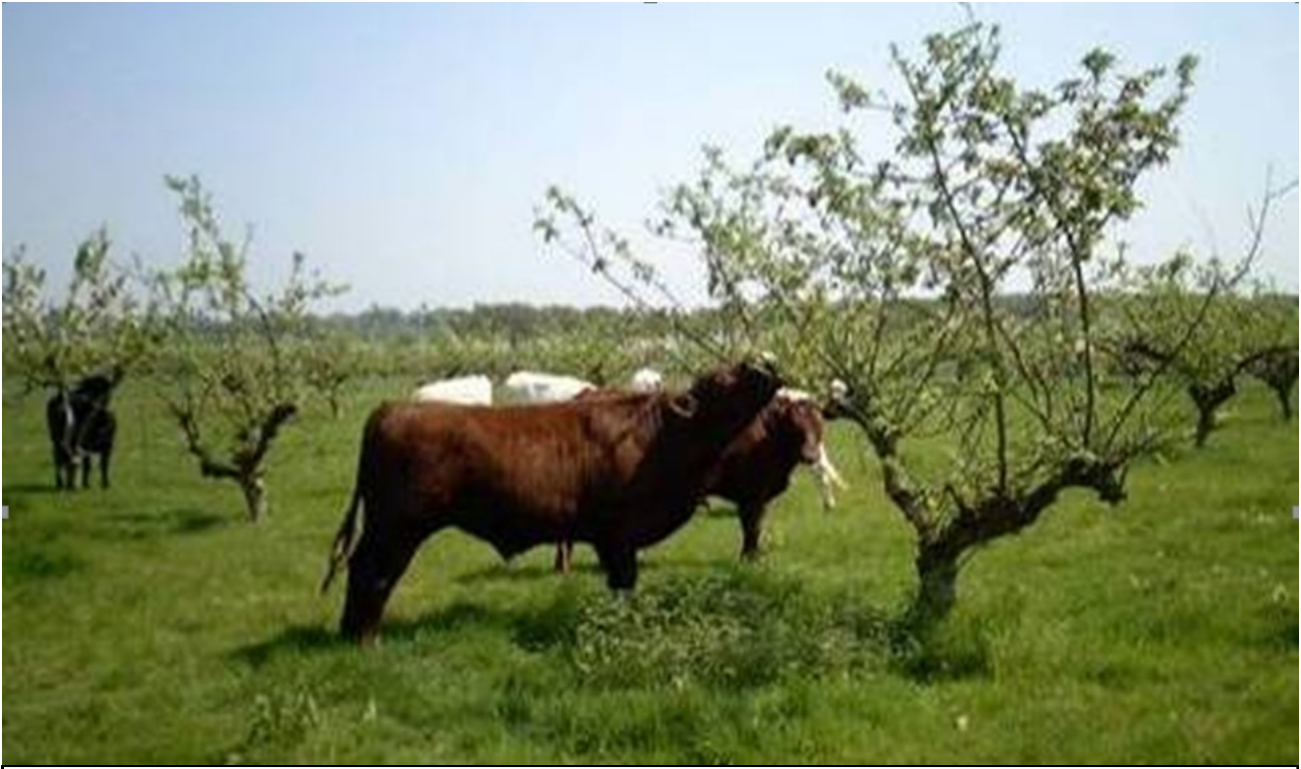
Fig 10. These apples are on a semi-dwarfing rootstock, MM106, which do not do well in grassland and never make large standard trees.... but these cattle will ensure that they won't be here for much longer. Horses are even quicker at demolishing fruit trees!