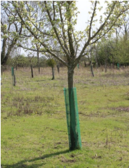
Fig. 9 A sheep grazed orchard over 10 years old, now protected by a 1 m high plastic mesh tree protection system.

Netting of this sort, for example ground protection netting, such as that used for paths or car parks, with an approximately 1.0 - 1.5cm square mesh, can be used for protection. In recent years, some affordable plastic mesh designed for light fencing, with a mesh of about 2cm and in heavy gauge, has been sold for “tree protection”, sold as rolls, cut as required and joined with nylon cable ties. Open mesh guards like this are NOT recommended for young trees as branches, and even the leader, may grow out through a mesh, but they are ideal as a long term protection when the initial tube protection splits after 5-7years. In the winter of 2019-2020 quite old apple and pear trees and, even more unlikely, cherry plums over 15 years old, and over 40cm in diameter, were attacked by rabbits and muntjac deer.