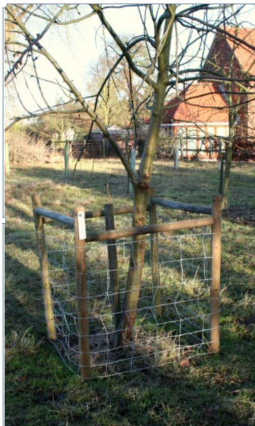
Fig 6. 1.2m high, four-post-&-rail sheep protection

In regularly sheep grazed sites, three or four post protection systems (shown in Fig 7 for new trees) is recommended from initial planting (if funds permit). This is by far the best solution and safer than just a post and tube, but expensive. For large sheep breeds, such as Suffolk, Norfolk Horn, Leicester, and Romney this will be necessary; with care small breeds, Southdown, Ryland, Portland and Shetland are reasonably safe with just a 65mm post and tube, although accidents will happen!