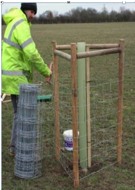
Fig 7 The Natural England three or four post-&-rail system

The three or four post-&-rail system uses 80cm sheep fencing (C or L 80/15/15).