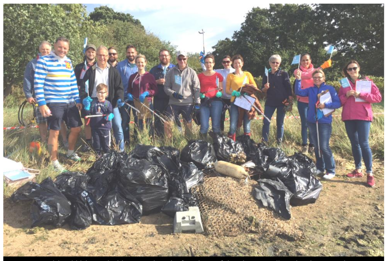
25 Group with rubbish: Fred Olden Travel on the foreshore of the River Orwell at Alnesbourne Priory

Suffolk played a big part in the MCS national success by organising 24 events. 664 volunteers filled nearly 69 bin bags, donated over 800 hours of their time and collected 184 kg of rubbish.