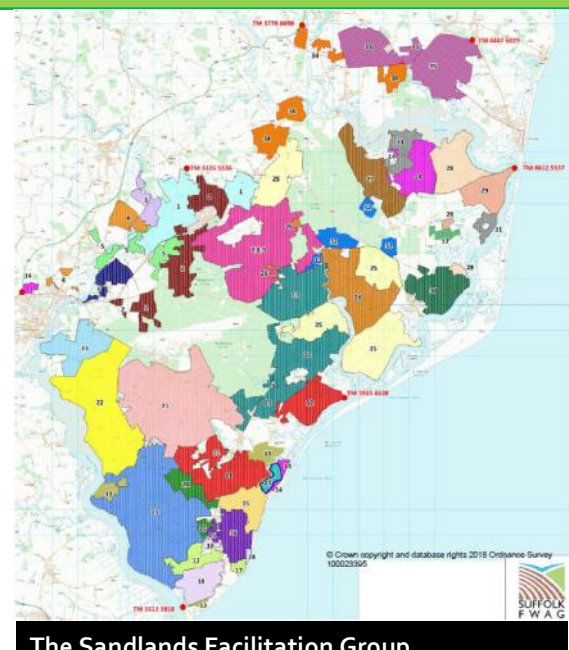
The Sandlands Facilitation Group

This farmer-led initiative gives its members training opportunities, a support network, the opportunity to deliver wildlife benefits outside of Stewardship schemes and knowledge/resources/labour sharing.