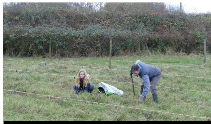
A local father and daughter donated their time because they will walk past the new wood most days.

In 2019, the Woodland Trust will be making 200 fully subsidised Targeting Tree Disease packs available to landowners in the Eastern Claylands of Essex and Suffolk. They contain 45 UK sourced and grown trees and include three species from the following five: oak, hornbeam, silver birch, wild cherry or beech. The Tree Packs will include trees, guards and stakes and need to be picked up from a selection of pick-up points in the project area.