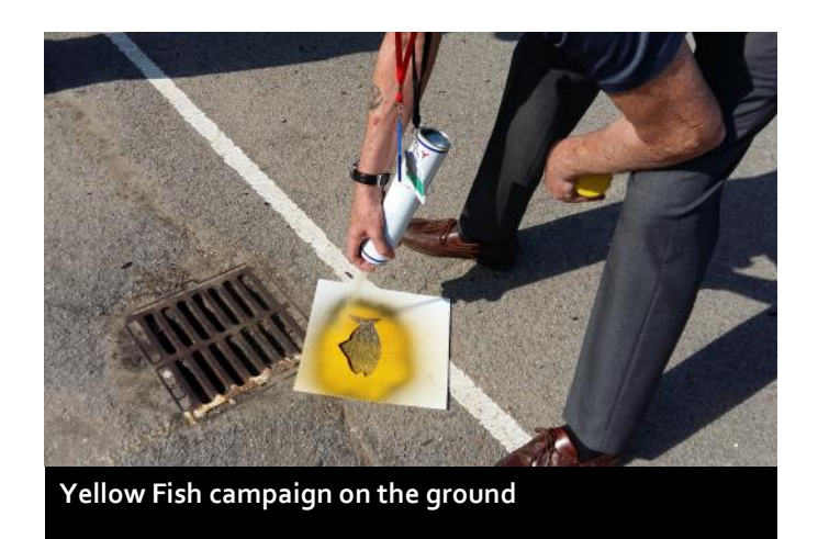
Yellow Fish campaign crafts - Halesworth library Aug 2018

Groundwork is working with East Suffolk Councils to deliver the key messages to these areas on behalf of the <u>Greenprint Forum</u> >